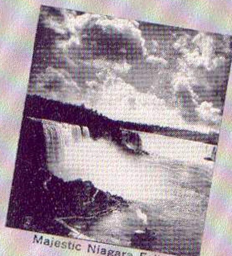
Majestic Niagara Falls