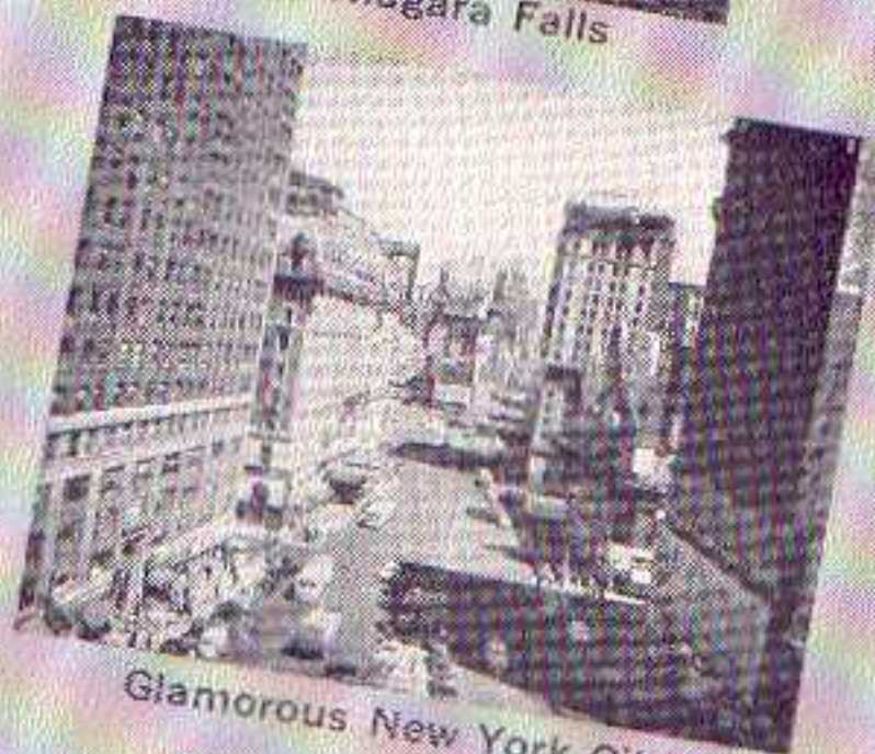
Glamorous New York City