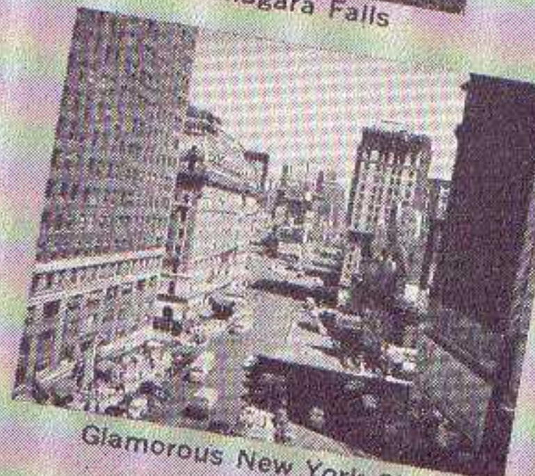
Glamorous New York City