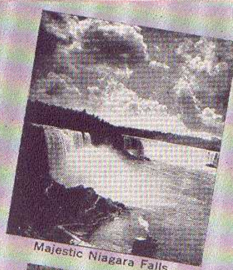
Majestic Niagara Falls