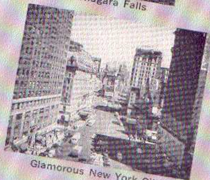
Glamorous New York City