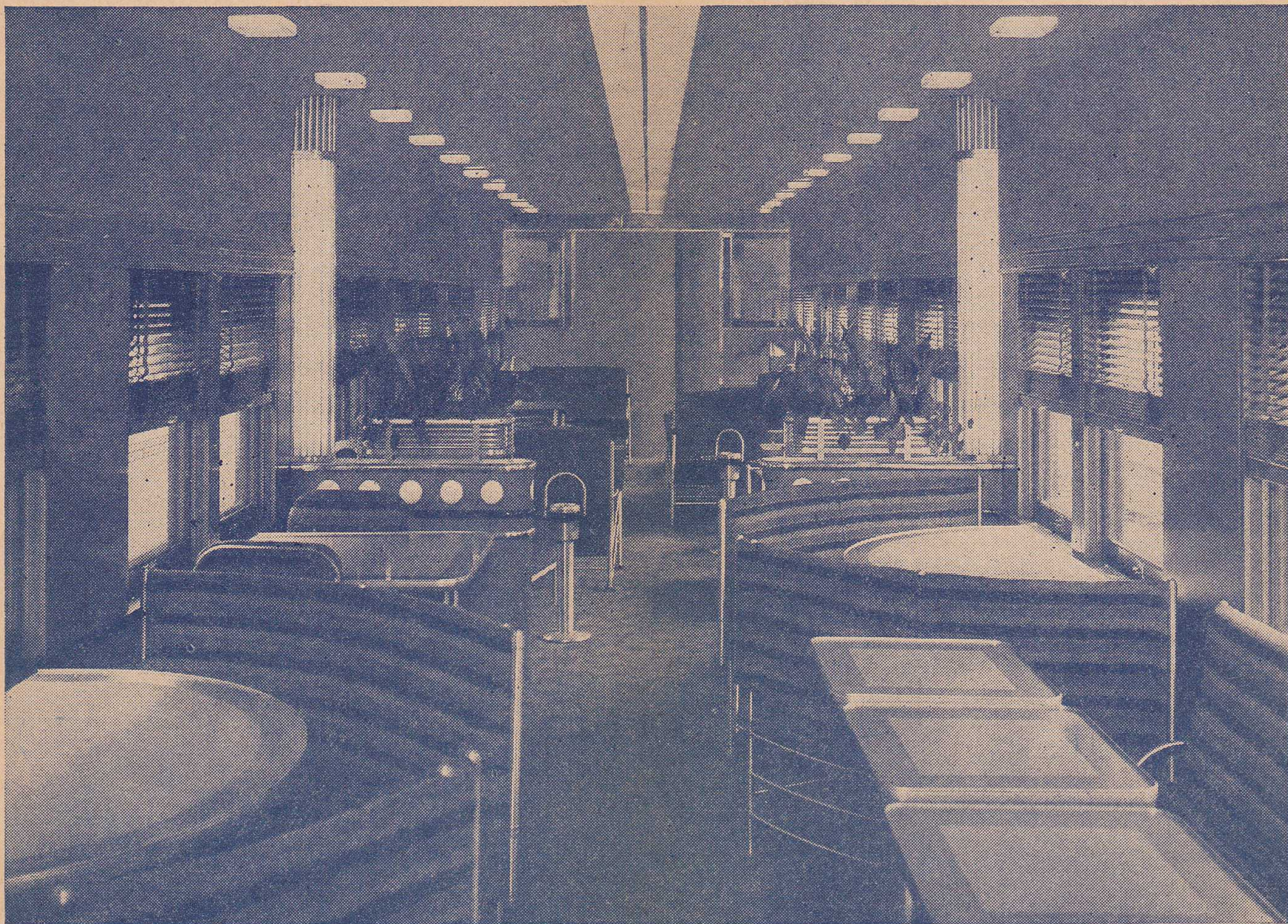
New Lackawanna Lounge Car a Luxurious Home on Wheels

Lackawanna has again given its Pullman patrons the smartest and most luxurious club-lounge car on wheels. Expert decorators and Lackawanna engineers have cleverly blended their talents in combining rich beauty with modern travel comfort.