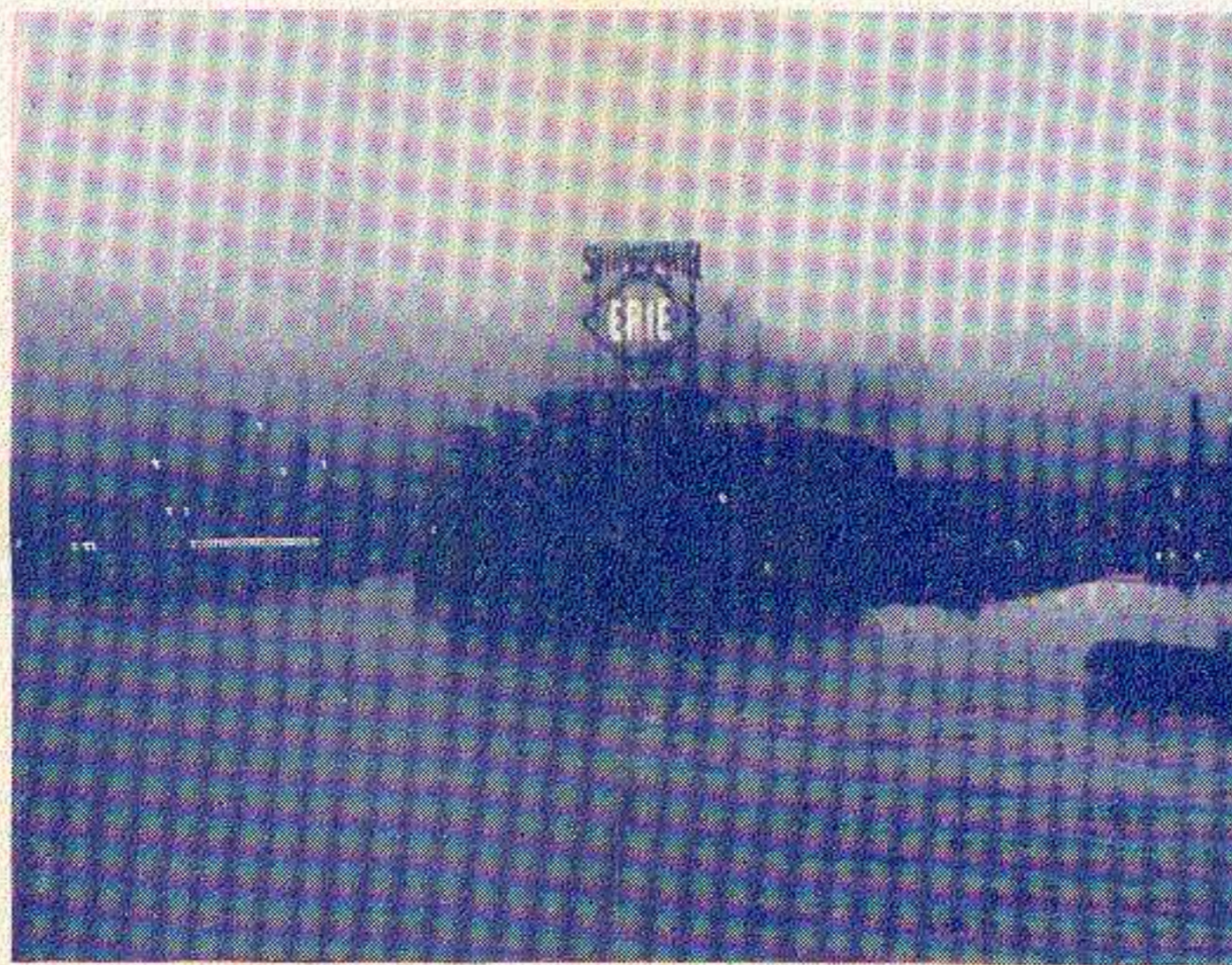
Erie Terminal, Jersey City, at Dusk

BOTH coasts, National Parks, California, Colorado. Circle tour, home town to home town. Go one way, return another. Stop over anywhere. $135 in Sleeping or Parlor Cars plus charge for space occupied.