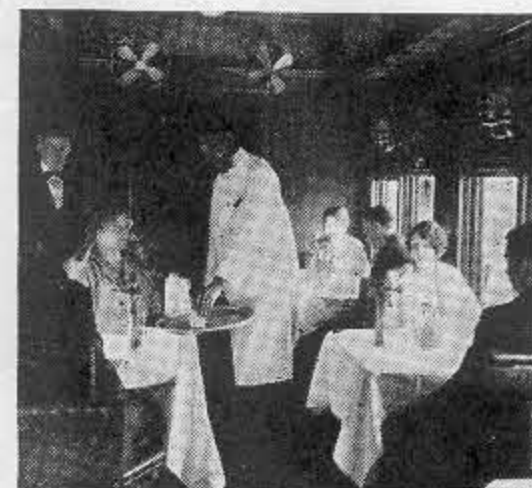
A Corner of the Dining Car