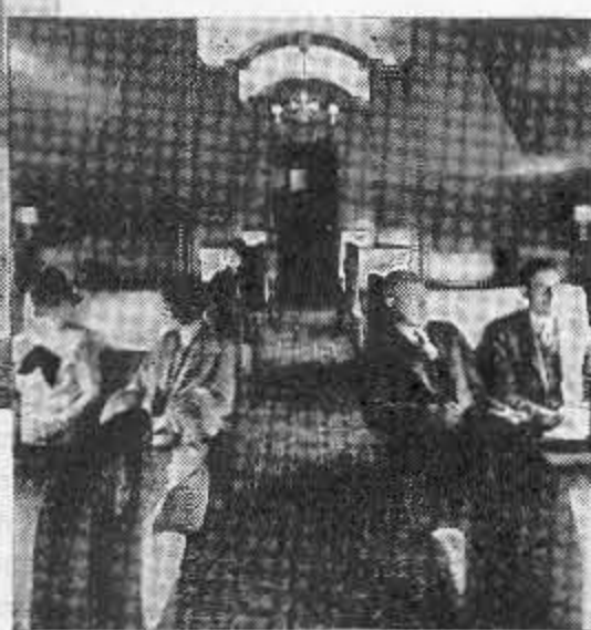
Permanent Headboards Afford Semi-privacy