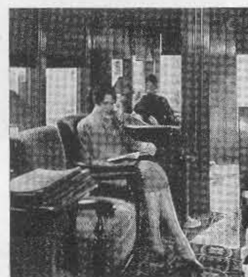
In the Sun Room Observation Lounge Car