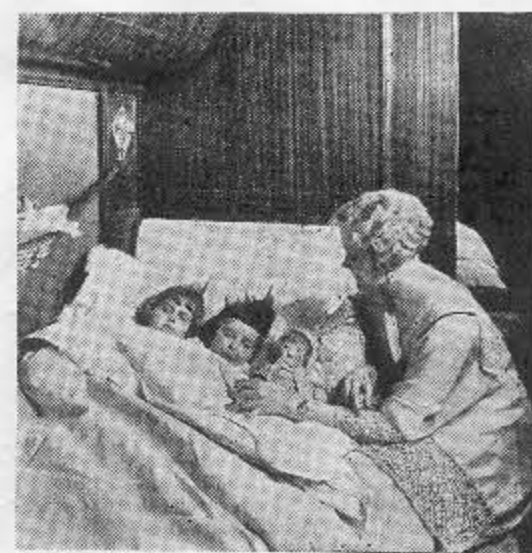
Ready for a Restful Night